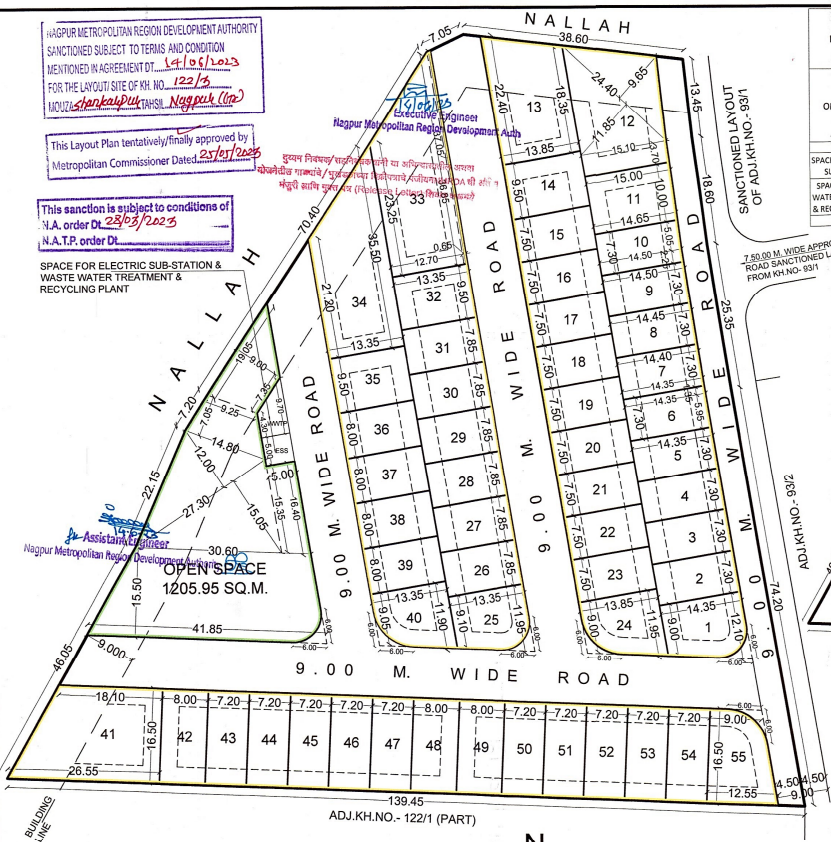
LAYOUT PLAN SCALE - 1:500

SPACE FOR ELECTRIC SUB-STATION & WASTE WATER TREATMENT & RECYCLING PLANT